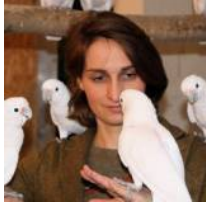
Doing Business with a Parrot