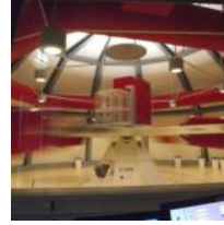
Sex at Zero Gravity