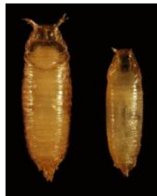
Bantam mutant animals (right) show reduced body size as a result of abnormally high steroid hormone levels. Credit: © M. Milán lab, IRB Barcelona. Author: Laura Boulan