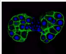
The fly prothoracic gland (in green) produces steroid hormones.