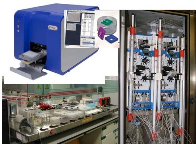
Figure 1. A selection of instruments purchased for the Facility. Caliper LabChipGX for HTP protein, DNA and RNA analysis and documentation, Äkta Xpress systems for automated large scale protein purifications and Theonix liquid handling robot for HTP expression screening, plasmid purification, etc.

The Protein Expression Core Facility Unit was founded to carry out High Through-Put (HTP) activities in which many variations of an experiment (eg, cloning and expression screening of truncations or mutants of a protein) can be performed in parallel. The capacity to simultaneously perform many experimental variations on a single theme can significantly decrease the time taken to solve a particular cloning- or protein-related problem, thereby bringing experiments to more rapid conclusions and, more importantly, leading to rapid publication of data. In addition to the time savings offered by HTP methods, they are also generally considered cost-effective and can significantly reduce project and laboratory costs. Many of the protocols are automated, with the Facility making full use of liquid handling robotics for small-scale HTP plate handling and automated purification systems for larger scale protein purifications. The Facility also offers many high quality reagents for cloning and expression, competent bacterio-phage-resistant E. coli strains, specialised expression media and recombinant enzymes at prices substantially lower than commercial ones. We also offer custom cloning and vector modification services.