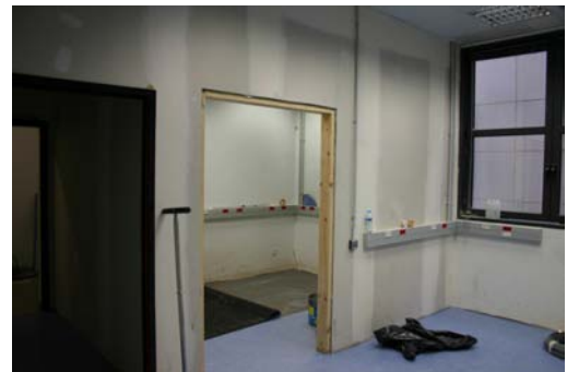
Figure 2. Construction work on the Facility in 2008. The room for the spinning disk confocal microscope in August (left) and November (right).