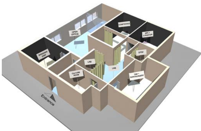
Figure 1. Layout of the ADM Core Facility located in the Barcelona Science Park. 3D render: Arch M Corda.

The Facility offers the following techniques: